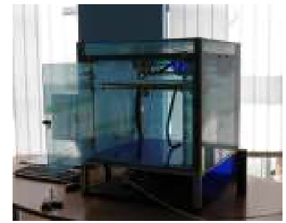
TeleDom Innovation centre 3D Printer

Assessment : The assessment strategy takes into account the different roles of each individual unit of the programme. The assessment strategy employs a range of methods such as individual programme work (essays, reports, literature review), group projects (reports, presentations, case studies). The range of assessment is designed to reflect the learning outcome of each unit.